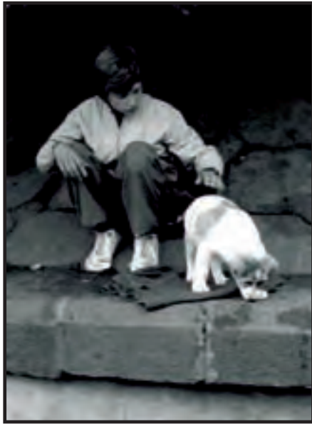
Latvian youth 1994.