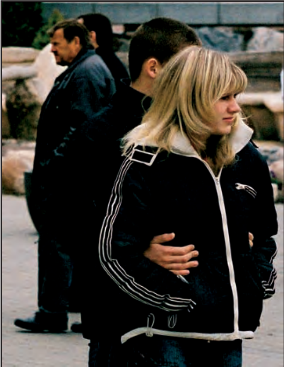
Love is in the air in modern Latvia (2005).