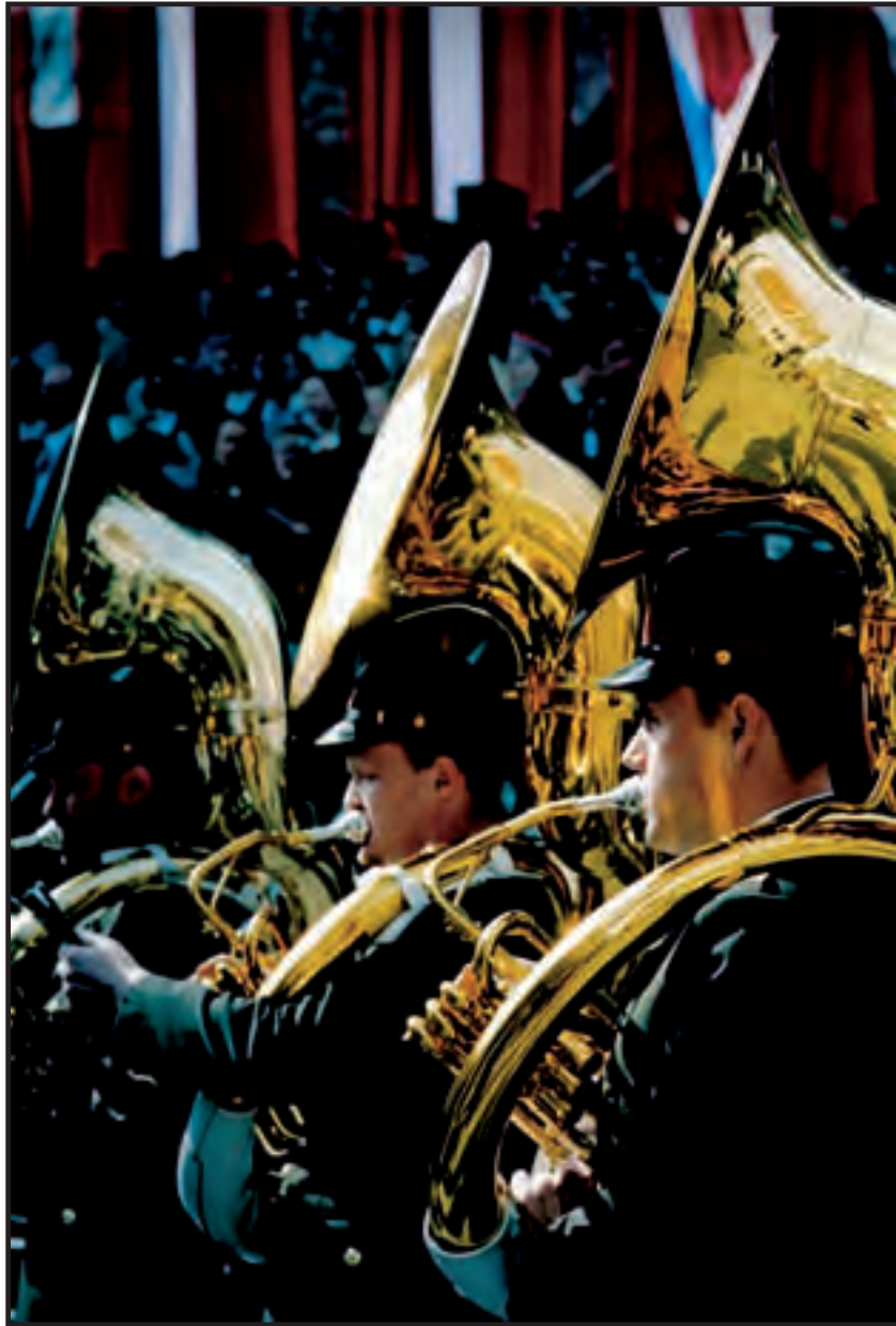
Riga, May 1, 2004: The transition period since the Soviet Union is over and hornists celebrate the entrance into the European Union.