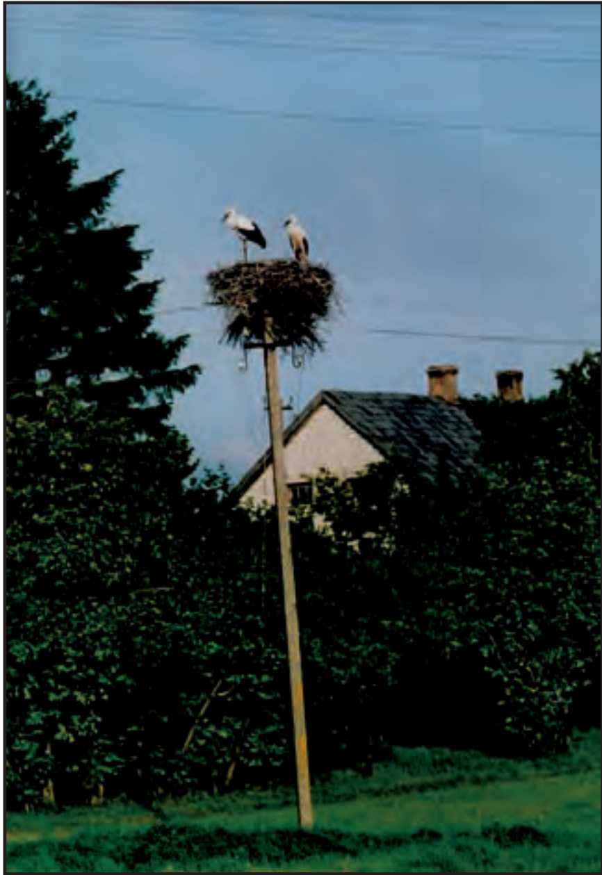
Storks doing a bad job for Latvian demography (1993).