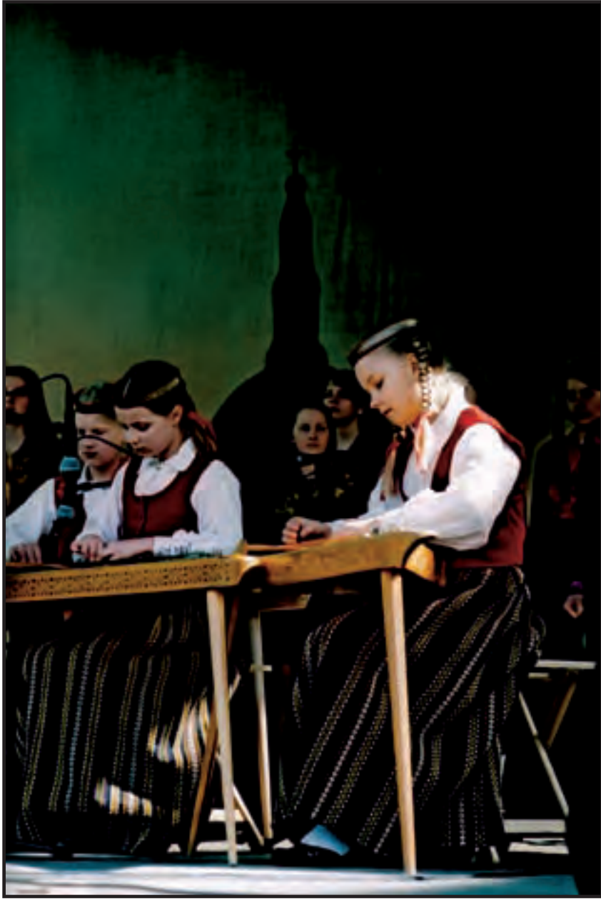
Riga, May 1, 2004: Children string players with no personal memories of the Soviet Union also contribute to the celebration.