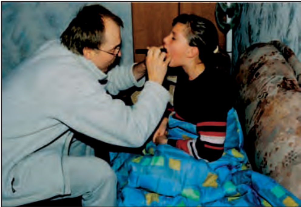
Riga house call 2004: The doctor seeing a 12 year old girl with a sore throat.